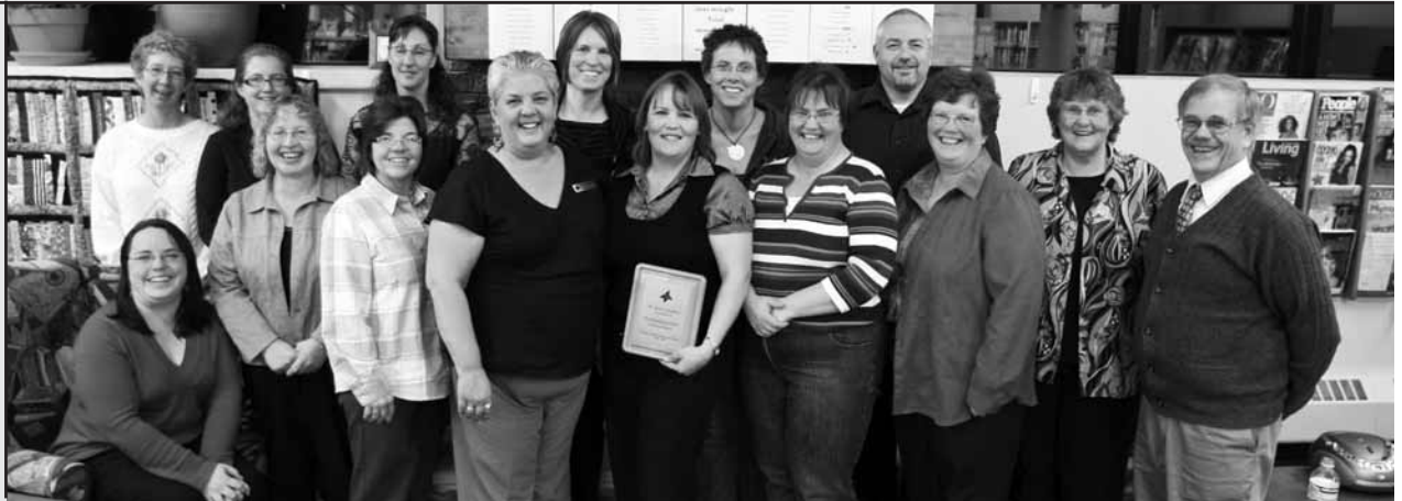
Blackfalds Library Award of Excellence presentation

excellent service to their communities over a five year time period.