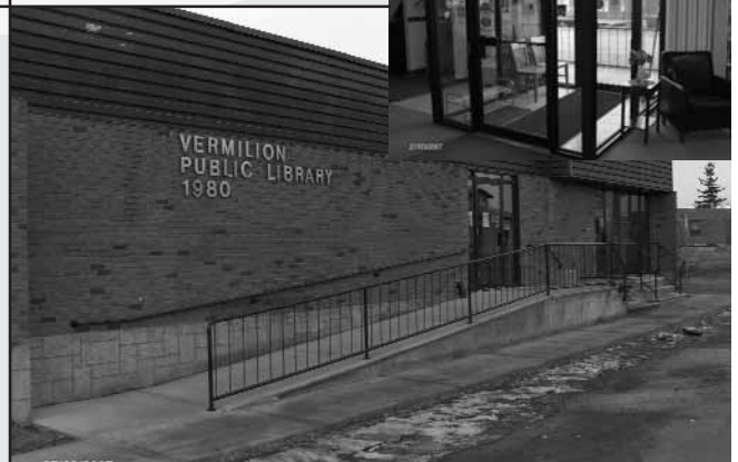
Current Vermillion Public Library

"Community" is what Vermilion Public Library is about!