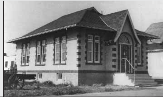
Old Vermillion Public Library