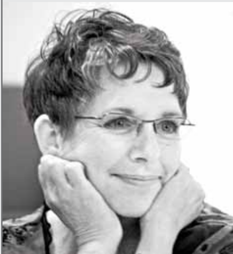
At the ALTA workshop held April 4th in Fort Saskatchewan